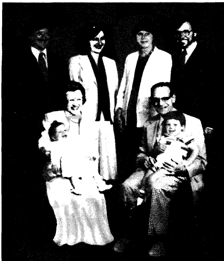
ii) Extended Family